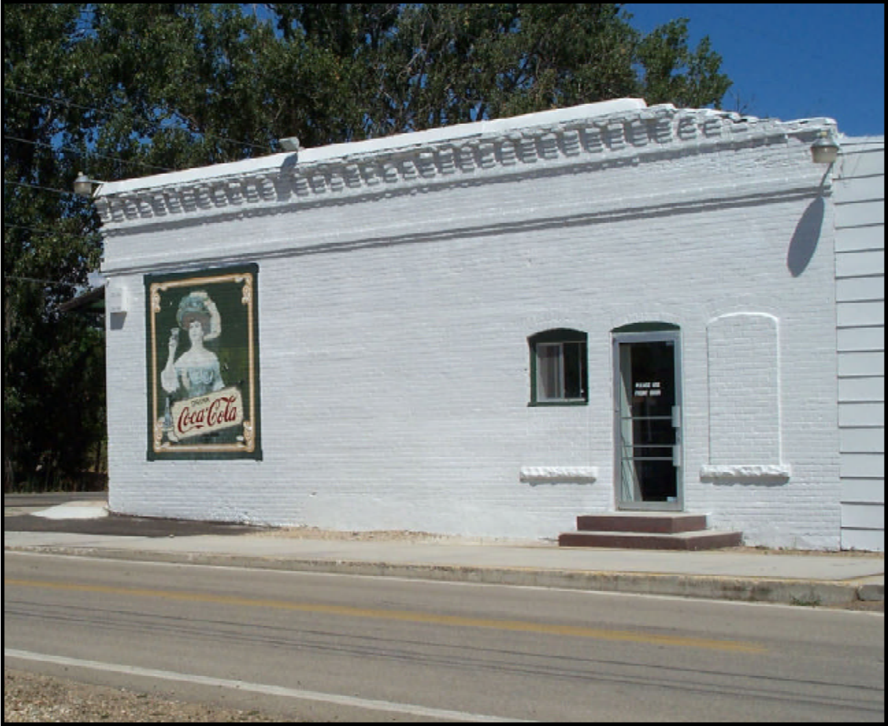
Ustick Merc, with Mural