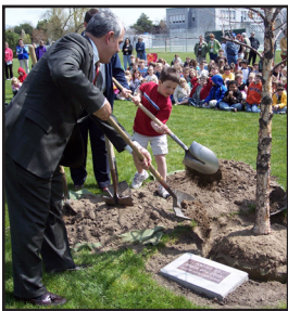
Education and action are cornerstones of Arbor Day.